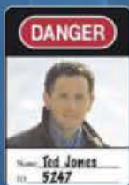
Photo ID label for S31, S33, 406 and 410. Label model S142 available August 2010.

Available Key Retaining (model S31) or Non-Key Retaining (model S33) for use with group lockout.