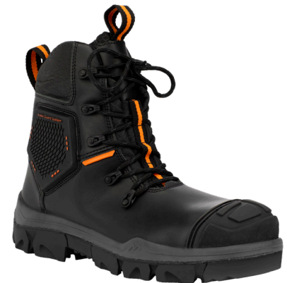
MTS Ballast 2.0 (SKU: 6270613)