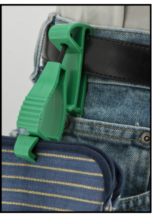
Slips over a belt, heavy waist band or pocket