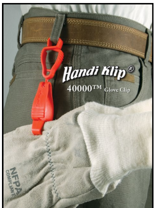
Attaches to a belt loop or directly to clothing